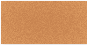
COPPER PENNY ♦ SRI: 42