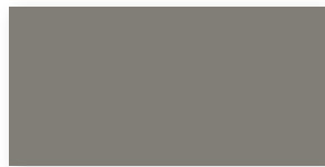
OLD ZINC GRAY SRI: 40