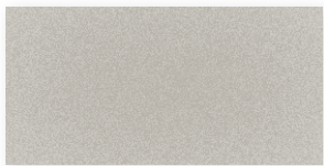
SILVER METALLIC ♦ SRI: 58