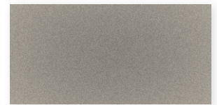
WEATHERED ZINC ♦ SRI: 40