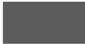
SLATE GRAY SRI: 30