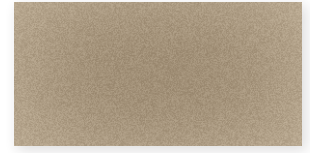
CHAMPAGNE METALLIC ♦ SRI: 49