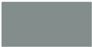
OLD TOWN GRAY SRI: 42