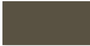
WEATHERED COPPER SRI: 27