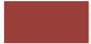
RETRO RED SRI: 25