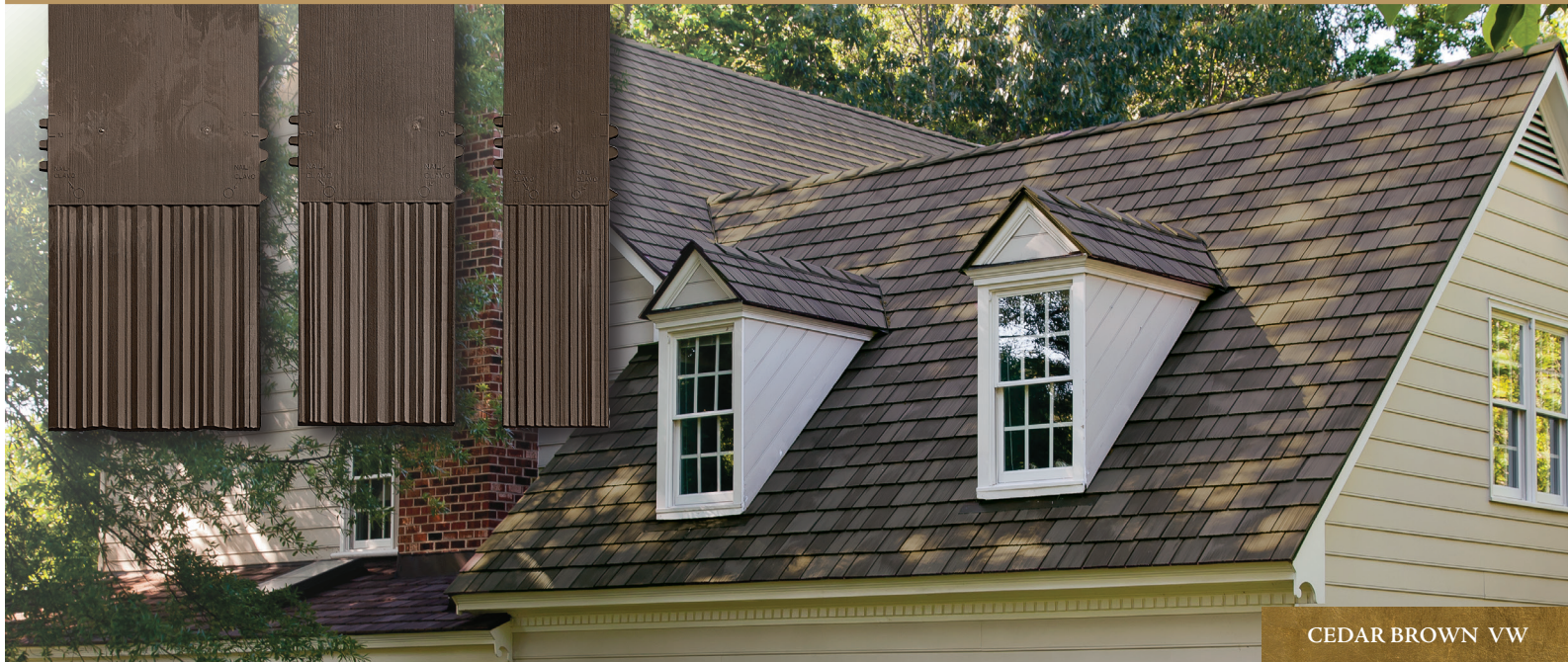
CEDAR BROWN VW