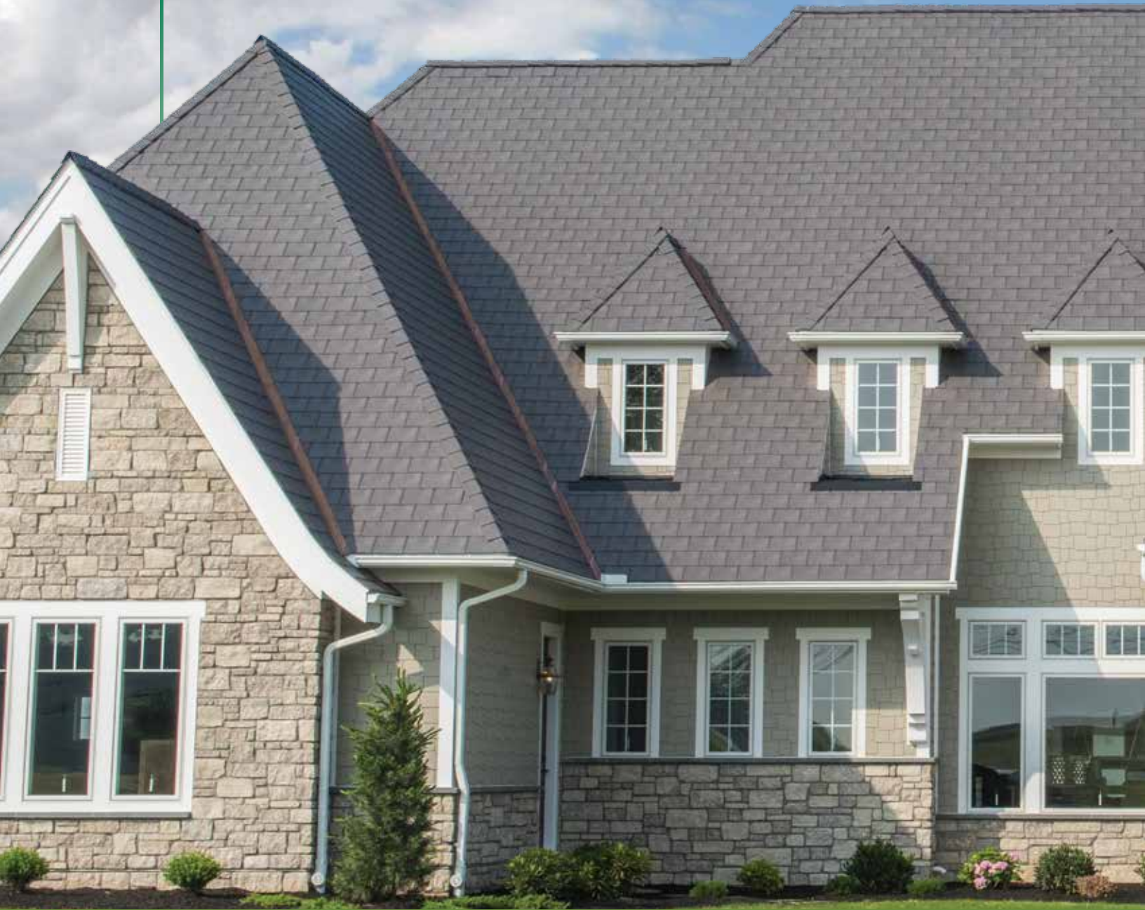
Charcoal Grey Slate

“We live across the street from a prestigious builder in our area... When we were having our Enviroshake roof installed, he liked what he saw and a few months later an Enviroshake roof is now on one of his homes!” – Carol Kranz