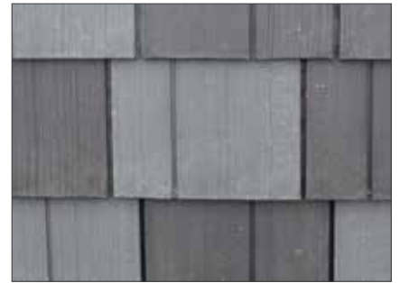
Multi-Tone* (Combination of Silvered Cedar & Aged Cedar)